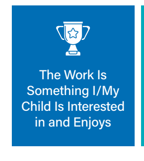
Top 5 Career Characteristics From Students & Parents